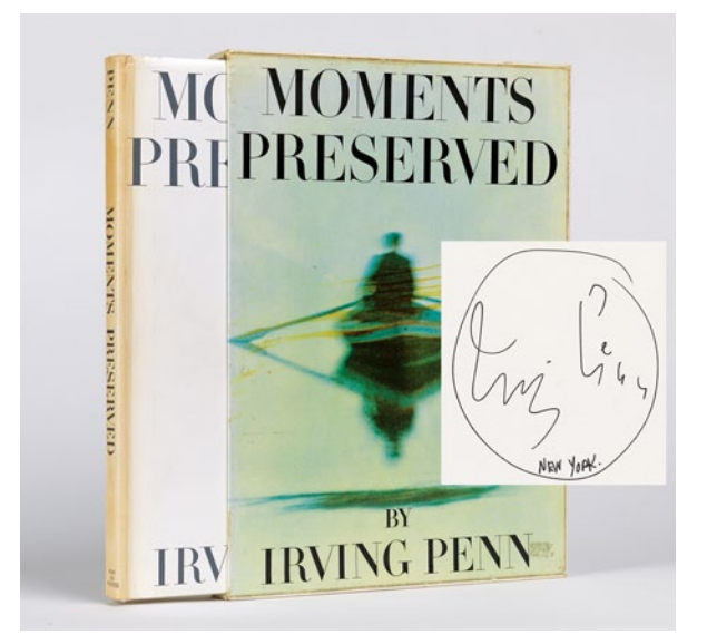
Irving Penn: Moments Preserved ($1,500–$2,000) at Swann Galleries.

photography. He quickly became enchanted with the idea of how beautifully the book presented an artist's body of work. Soon, Diodato found himself building a comprehensive, 20th-century photo literature collection, which he complemented with remarkable fine art photographs by master photographers and artists in his library, several of which are also featured in the auction.